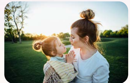
New Directions for Families

7108 S Alton Way Centennial, CO 80112 (303) 694-3829