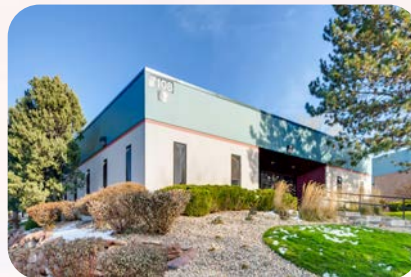
Valley Hope of Denver

22422 E Mainstreet Parker, CO 80138 (303) 841-7857