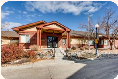
Valley Hope of Parker

1 Mission: Valley Hope will restore lives affected by addiction and support lifelong recovery.